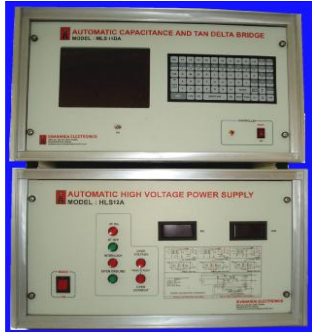
Option 2 : Front Panel Controlled