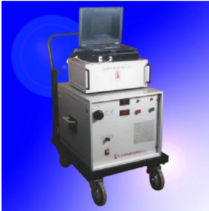
Option 1 : Laptop Controlled